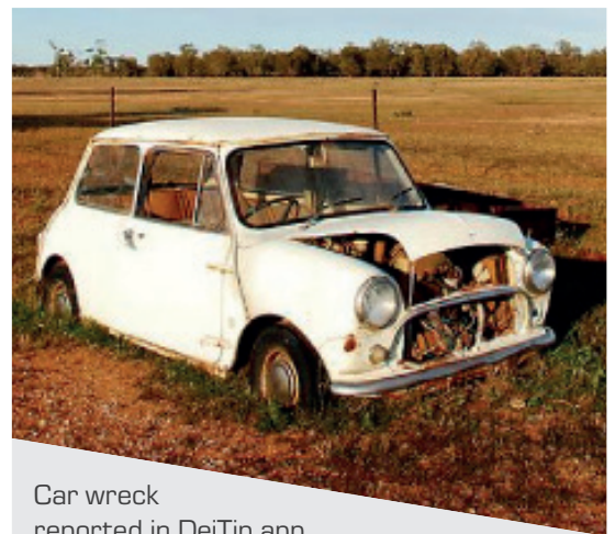
Car wreck reported in DeJTip app