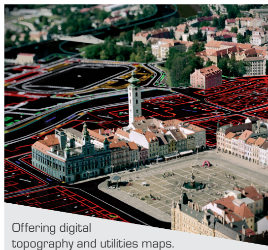
Offering digital topography and utilities maps.